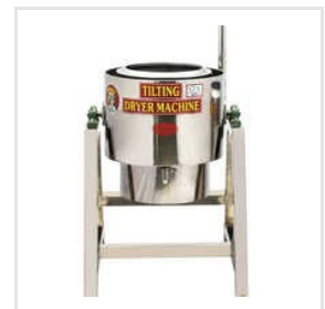
Tilting Dryer Machine