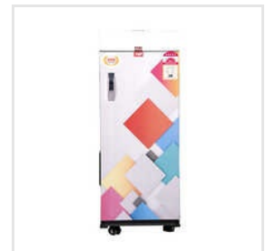
1HP Regular Flour Mill