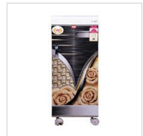
2HP Domestic Flour Mill